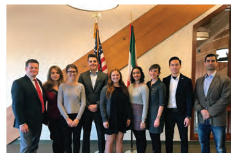
The CEI Student Consulting Team.

Twenty-two MBA students from the Corvinus School of Management in Budapest took part in the 9th annual CEI-organized executive MBA week in April in Connecticut. During the week, they visited Quinnipiac's campuses, the QU Center for Innovation and Entrepreneurship, and major international corporations throughout Connecticut, including Achillion Pharmaceuticals, American Seal & Engineering, Foxwoods Resort Casino, LightSources, Marcum LLP, Movia Robotics, Onyx Moonshine, and Updike Kelly and Spellacy.